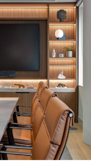
Feature Media Unit