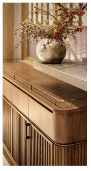
Coffee Credenza with Fluted Detail