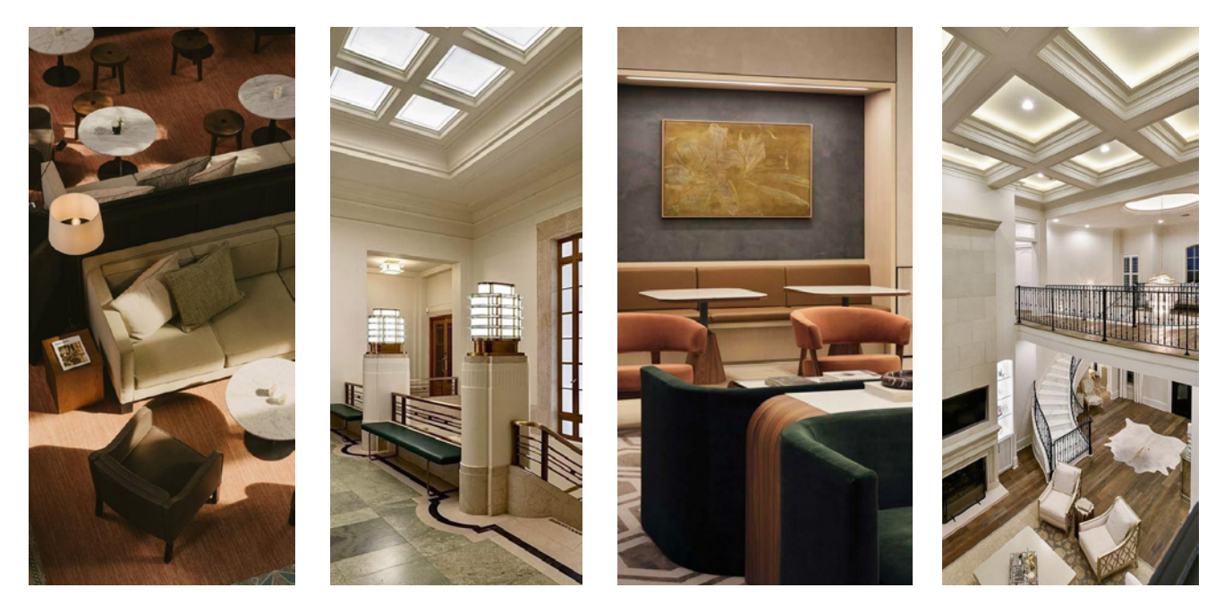
Design concept imagery. Final space may differ.